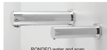
RONDEO water and soap

Soap bottle installation behind the wall, under the wash basin or behind the mirror.