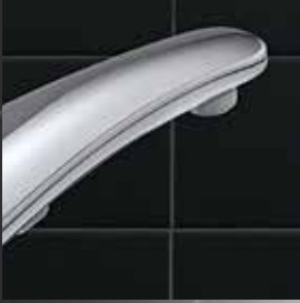
SureFlo™ Designer Finishes Automatic Liquid and Foam Soap Dispensers Page 6