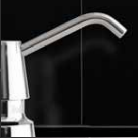
Manual Counter-Mounted Foam Soap Dispenser Page 7