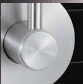
Bright Polished Cubicle Collection Pages 26, 35, 37

Bobrick.co.uk Bobrick.la Bobrick.de Bobrick.com