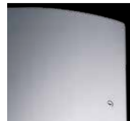
Seamless monoform draws, flush locks, precise fit and finish

ConturaSeries is manufactured with satin-finish type 304 stainless steel.