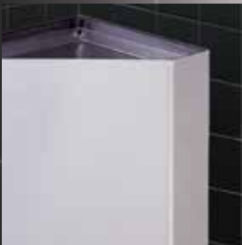
Corner and Pedal Waste Bins Pages 18, 19