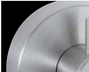
Beveled edges for design distinction.