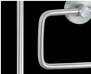
Continuity of diameter dimensions.