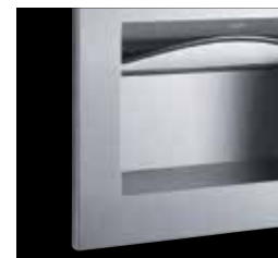
Flush-mounted, rectangular doors and openings

TrimLineSeries features 90° angles on all exterior and interior corners and openings. Flanges are concealed for additional design simplicity.