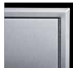
Classic bevelled flanges, hemmed edges, piano hinges

ClassicSeries accessories feature satin-finish type 304 stainless steel throughout, whilst being engineered for the economic demands of price-sensitive projects.